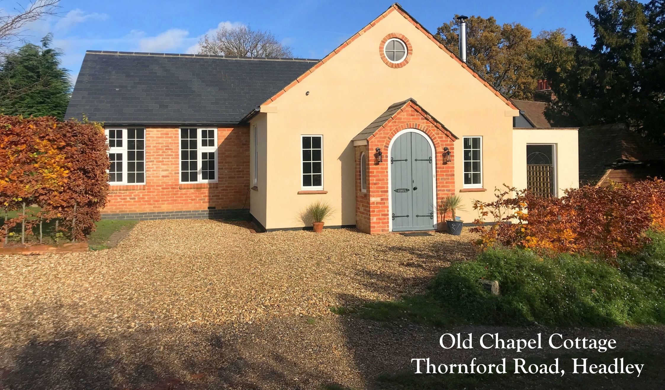
Old Chapel Cottage Thornford Road, Headley